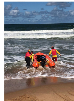
Pictured above; 2nd IRB Crew assessment for season 2022/23