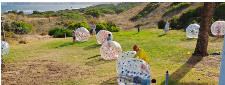
Pictured above: Nippers End of Season fun day

We have had a successful nippers season this year, though numbers were down in previous years we managed to get nice weather for most of the sessions. The kids had a wonderful time both at Chiton Rocks and at Middleton for the Surf Sessions. For this programme to continue into the future we require parents to volunteer to be on the Nipper committee, if you are willing to help out in the space please send an email to nippers@chitonrocks.com .