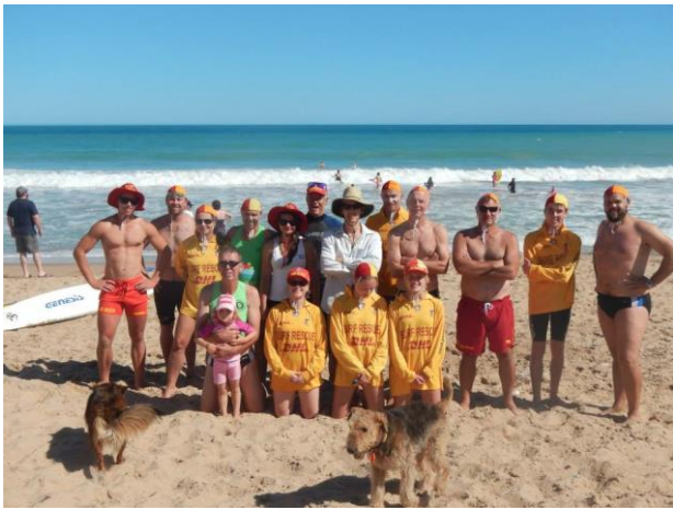
All the Club Champs and Teams Challenge competitors on Australia Day