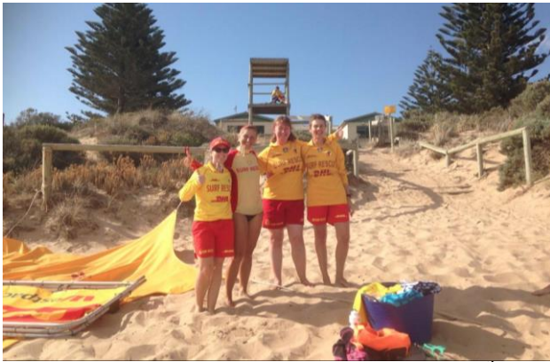
Girls passed the patrol inspection on 8 th February – great job!