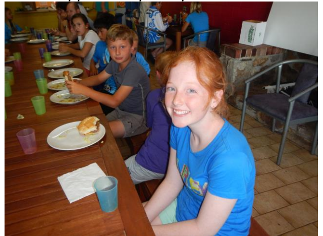
Chiton Nipper Camp Snaps...