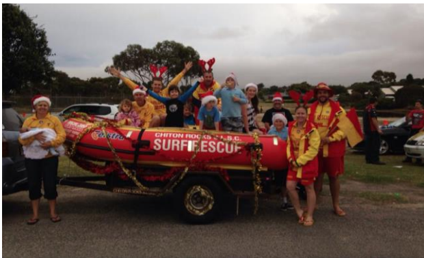
Goolwa Christmas Pageant